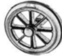
D x 4 pc