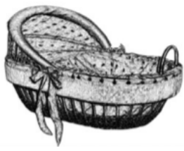
A x 1 pc