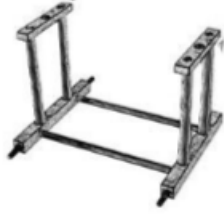
B x 1 pc